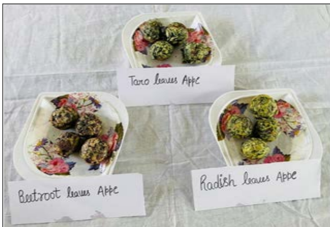
Plate 2: Developed Apple

The selected product was developed to enrich them with different high fiber incorporated in basic recipe respectively. Developed preparations were standardized in the laboratory of Home Science, Pushp Institute of Science & Higher Studies Pilibhit and were evaluated using 9-point Hedonic Scale.