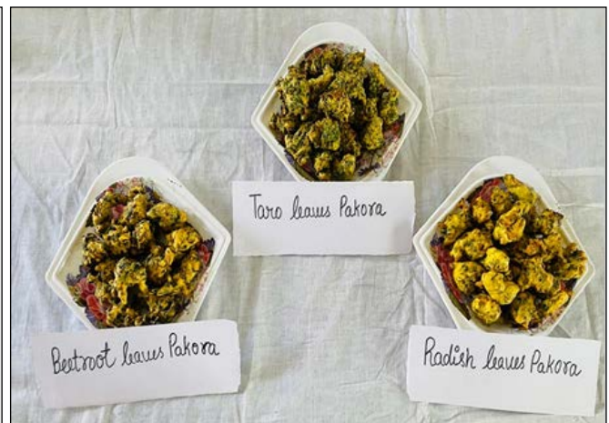
Plate 3: Developed Pakora