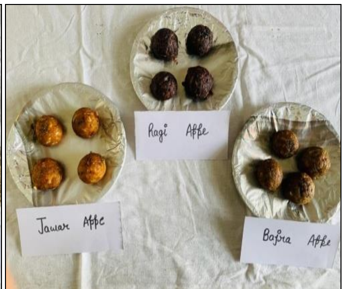
Plate 3: Developed Appe