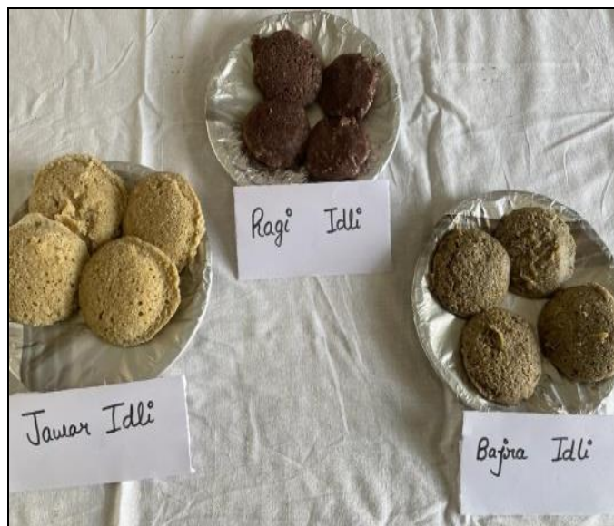
Plate 2: Developed Idli

these preparations were taken. The selected product was developed to enrich them with different Millets incorporated in basic recipe respectively. Developed preparations were standardized in the laboratory of Home Science, Pushp Institute of Science & Higher Studies Pilibhit and were evaluated using 9 point hedonic scale.