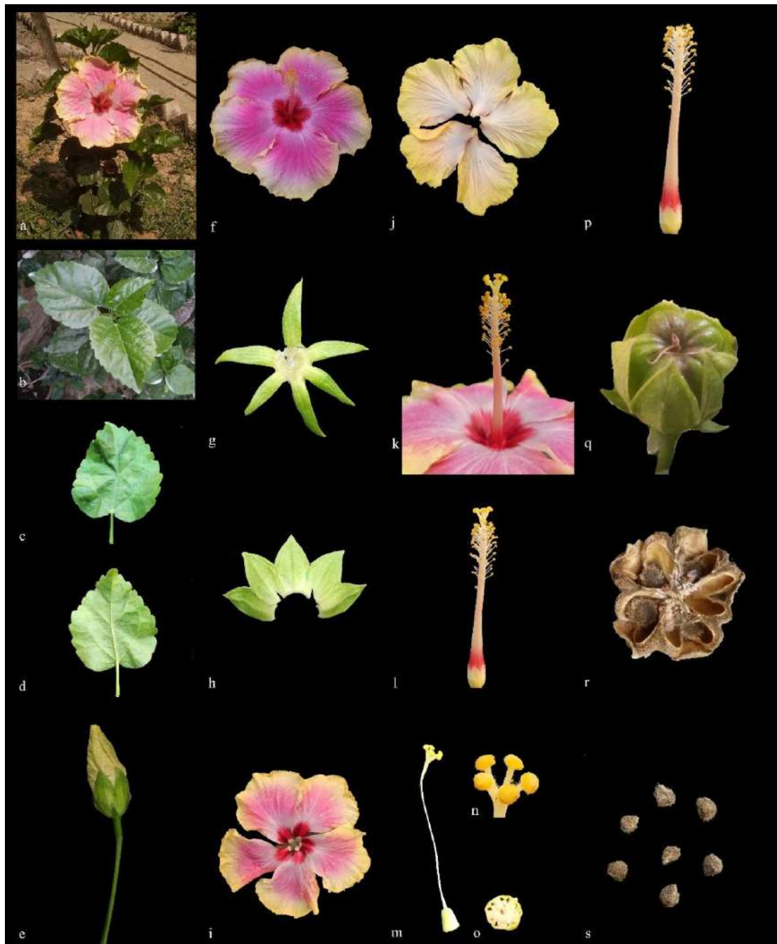
Fig 2: Hibiscus rosa-sinensis L. ‘Janaki Ammal’: a. Habit; b. Branch; c. Leaf- upper surface; d. Leaf lower surface; e. Flower bud; f. Flower-top view; g. Epicalyx; h. Calyx; i. Petal- top view; j. Petal- lower surface; k. Staminal column with red eye zone; l. Staminal column with pistil; m. Pistil; n. Stigma pad; o. T.S. of ovary; p. Staminal column; q. Capsule; r. Capsule dehiscence - top view; s. Seeds

Propagation: It can be done by cuttings, grafting, budding and seeds.